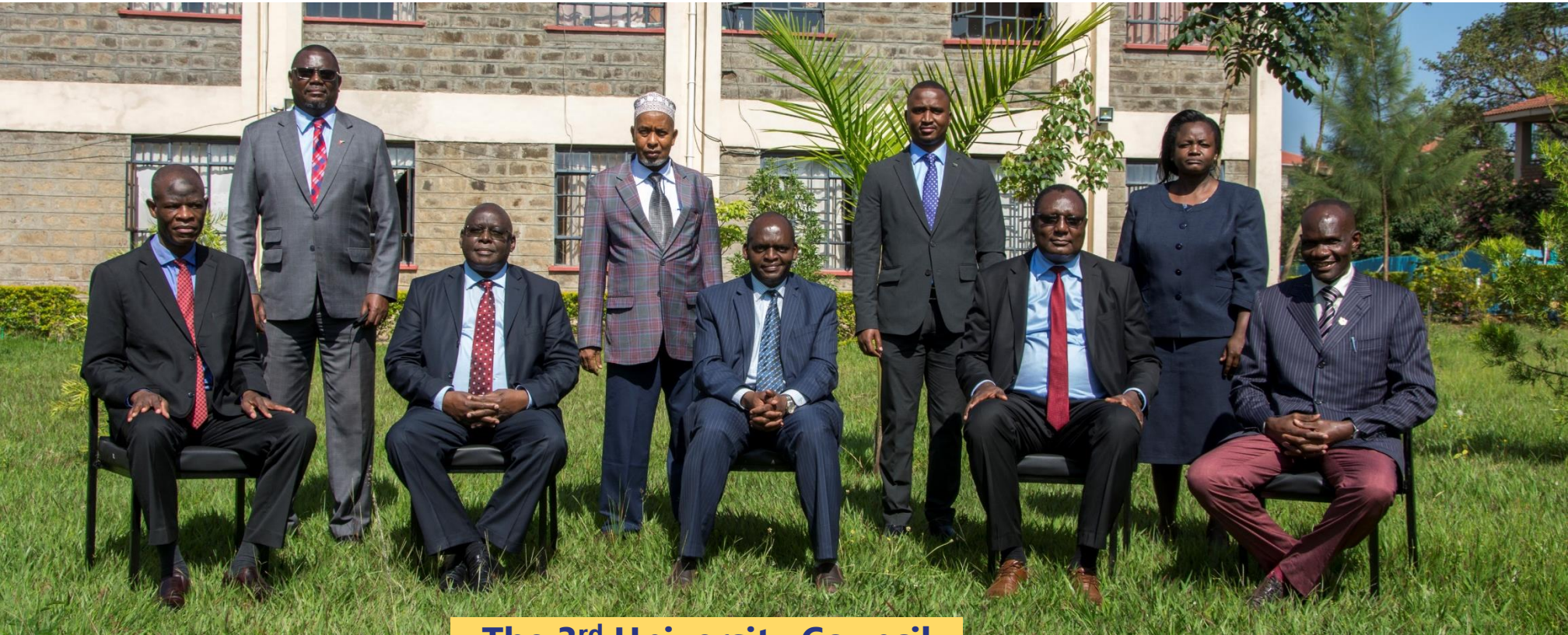
The 3 rd University Council