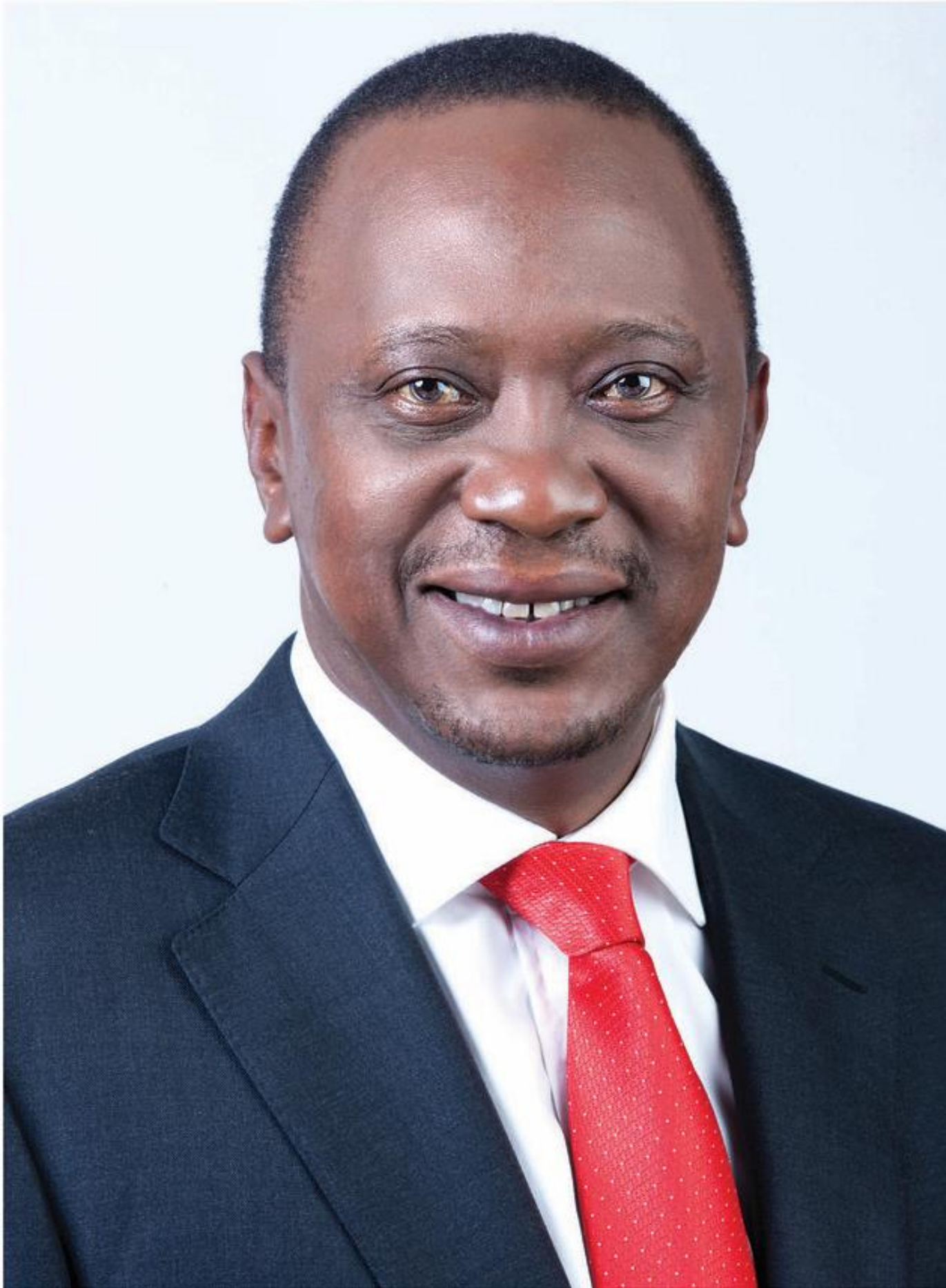
His Excellency, Hon. Uhuru Kenyatta, C.G.H., President of the Republic of Kenya and Commander-in-Chief of the Defence Forces and Chancellor of Kibabii University