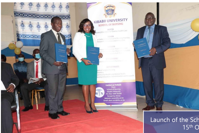
Launch of the School of Nursing on Friday 15 th October, 2021.

Welcome on board, in whatever capacity, and experience ground breaking innovations and world class education in nursing and other health disciplines.