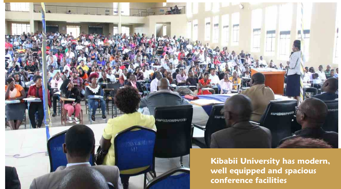
Kibabii University has modern, well equipped and spacious conference facilities

It also focused on teaching strategies for the effective ECDE teacher (excellence in classroom management, motivation and discipline), curriculum and teaching mandate, among other topics.