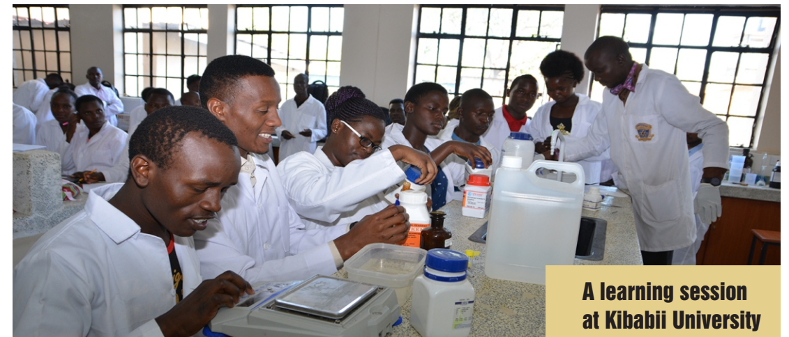
A learning session at Kibabii University