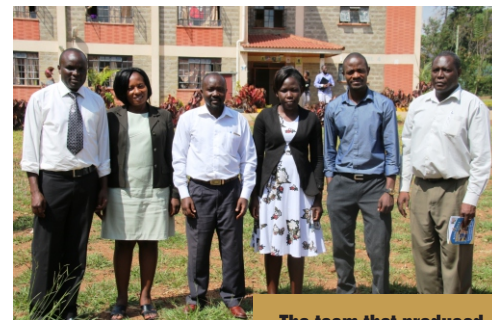
The team that produced this graduation newsletter