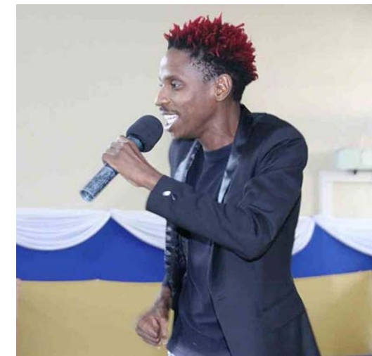
Comedian Eric Omondi also came around and left the Kibabii University community in stitches...