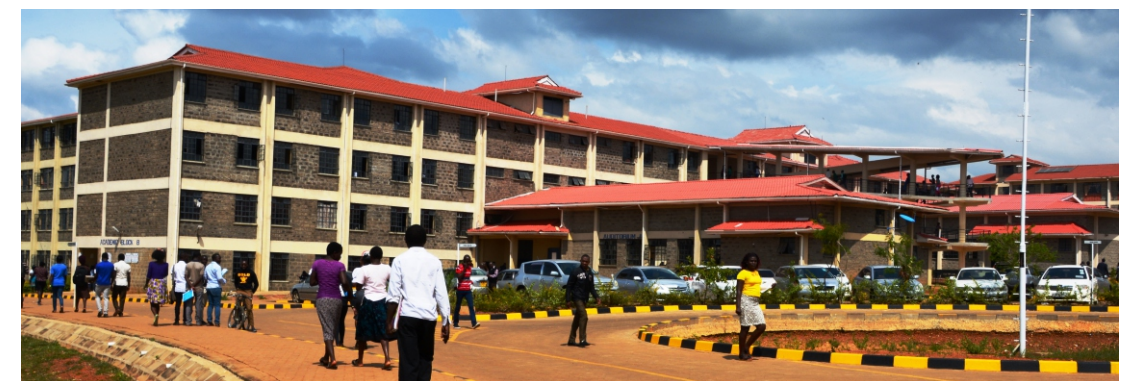
A section of Kibabii University Lecture Halls