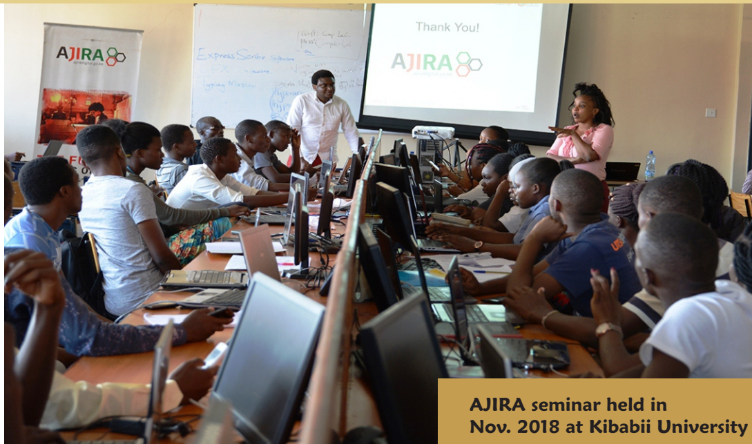
AJIRA seminar held in Nov. 2018 at Kibabii University

T he School of Computing and Informatics has won Ksh.64.8 million for Infrastructure development from the National Research Fund. This will be used to set up a model ICT HUB. Furthermore, Kibabii University Informatics (KUI) {Software Engineering} club got accredited by UNESCO hence adding value and recognition to the work being undertaken by the software engineering students.