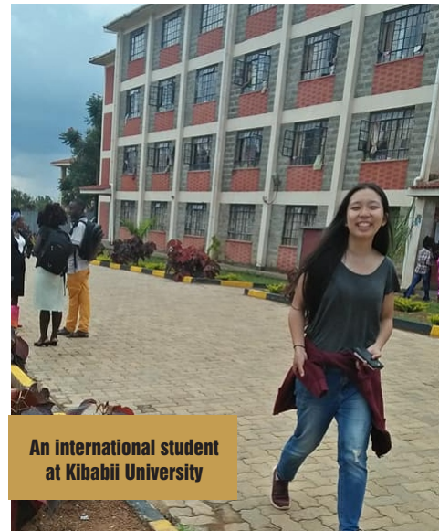
An international student at Kibabii University

Kibabii University is located off Bungoma-Chwele road approximately 7 kilometres from Bungoma town. It sits on 70 acres of land. The University has a serene and conducive environment for learning.