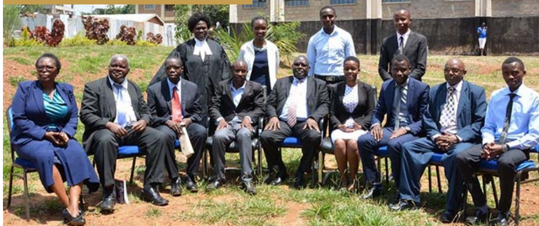
Senior Management with newly elected SOKU team

Kibabii University supports the realization of the “Big Four” Agenda by: starting Bachelor of Science in Nursing Program, which has been given a green light by the Nursing council; training community on crop post-harvest handling to improve on food security and enhancing access to health by conducting free health services to the community.