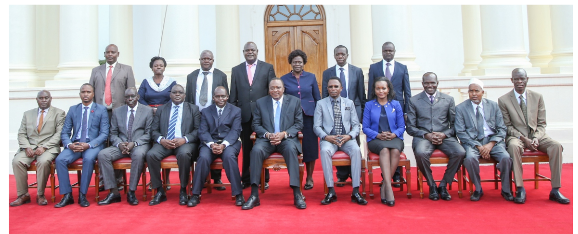
His Excellency Hon. Uhuru Kenyatta, C.G.H. President of the Republic of Kenya, and Commander-in-Chief of the Defence Forces and Chancellor of Kibabii University, Hon. Ababu Namwamba, Kibabii University Council and Management