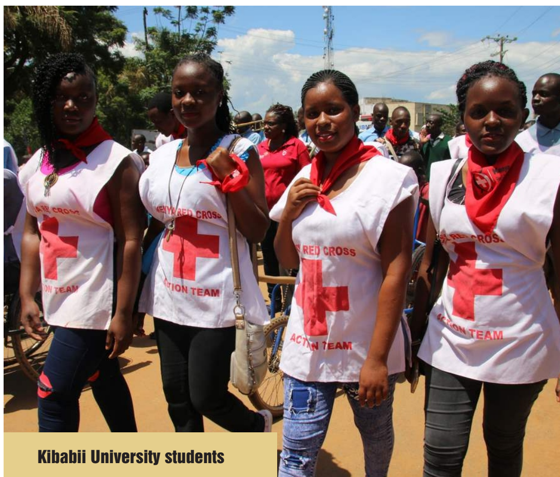
Kibabii University students

A bad attitude is like a flat tyre, you won't get anywhere till you change it