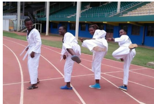
Kibabii University Taekwondo Team in Kigali in preparation for East African games to be held in December 2018 (Dodoma)